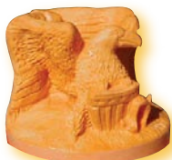
Cheese carving of an eagle

JULY 13-15 Greek Fest Milwaukee, WI (800) 884-FAIR www.annunciationwi.com Held at State Fair Park, Greek Fest offers live entertainment, adult and children's Greek dancing, and lots of good Greek food. Don't forget the baklava.